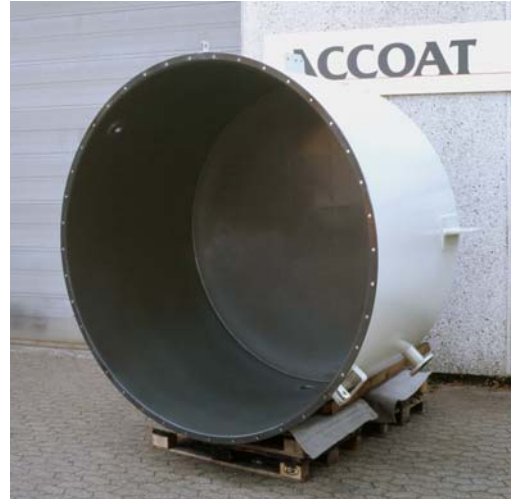
Tank for storage of sulphuric acid coated inside with Accotron

Within the semiconductor industry, which makes heavy demands on clean rooms and consequently on ventilation, the Accotron coating is applied inside the ventilation ducts. Gases extracted by suction often are aggressive and in this way the coating serves as corrosion protection. At the same time it has a compact structure to further facilitate the cleaning of the ducts. Eventually the non-combustible Accotron coating comply with the demands from the fire brigade authorities.