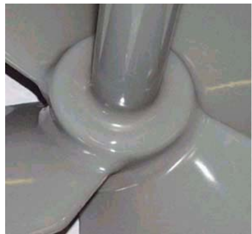
Mixer for the chemical industry coated with, Accotron

Accotron appears dark greenish and the top coat is applicable with foodstuffs according to the EU Directives Normally the coating is applied with a layer thickness of ½-1 mm which results in a sturdy and hard surface. The coating therefore is a good option for items exposed to wear. The coating is resistant to acids and bases as well as most solvents. But, a few solvents such as tetrahydrofuran should be treated with some of our other coatings.