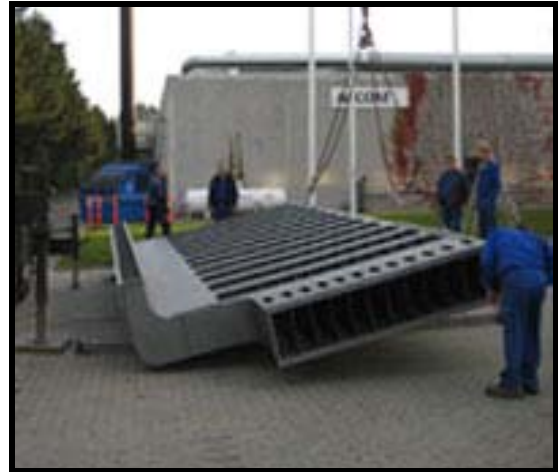
Vacuum boxes coated with Accolan silver

As a result of its excellent all-round properties, Accolan Silver is also suitable for use with frozen products and freeze-drying trays.