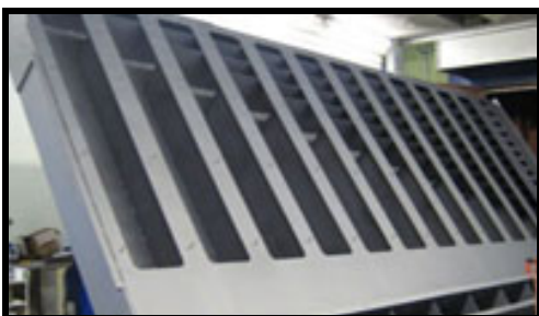
Vacuum boxes coated with Accolan Silver

We are happy to provide sample plates treated with Acccoat coatings free of charge, allowing you to see for yourself whether the coating matches your requirements. Contact our sales department for details.