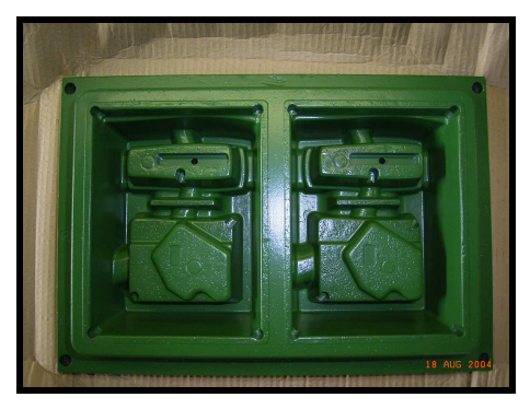
Equipment coated with Accolan G (Picture of cardboard box mould)

Accolan G is particularly suited to processing equipment for use with objects such as backing trays, rubber and tyre moulds, vacuum moulds for egg boxes cardboard boxes etc. Accolan G is suitable for use with cutting and welding equipment in the pharmaceutical industry as well as in the paint, varnish and glue industries as a coating for vats, mixing vats etc.