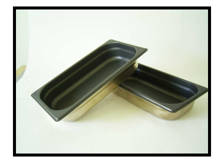
Baking trays coated with Accoflon 2C

We are happy to provide sample plates treated with Accoat coatings free of charge, allowing you to see for yourself whether the coating matches your requirements. Contact our sales department for details.