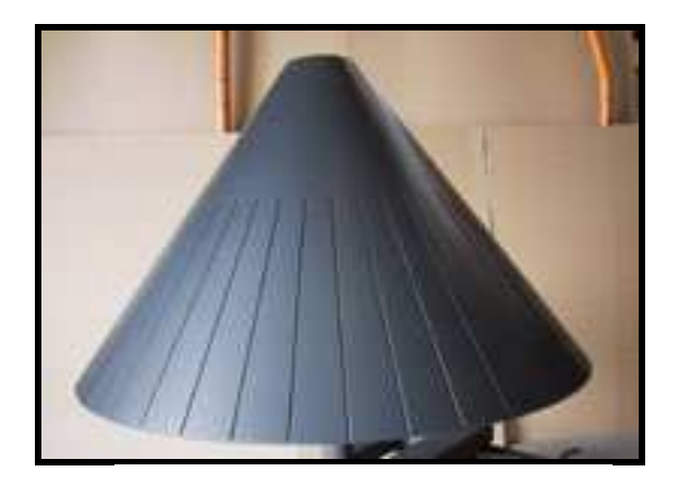
Cone coated with Accoflon H

Accoflon H can be used to coat a range of products, e.g. plastic moulding equipment and foodstuff production and transport equipment.