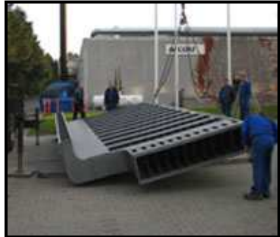
Vacuum boxes coated with Accolan silver

As a result of its excellent all-round properties, Accolan Silver is also suitable for use with frozen products and freeze-drying trays.