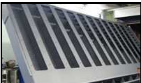
Vacuum boxes coated with Accolan Silver

We are happy to provide sample plates treated with Acccoat coatings free of charge, allowing you to see for yourself whether the coating matches your requirements. Contact our sales department for details.